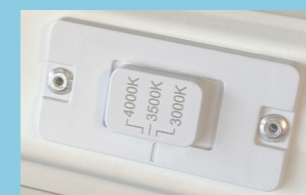
Colour temperature switch

There is no need to worry about lumen packages or colour temperatures anymore – it's always the same product and the adaption to your application can be done directly on site: