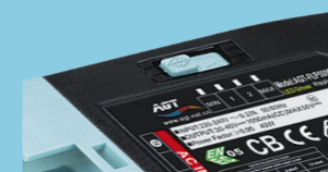
Lumen output switch